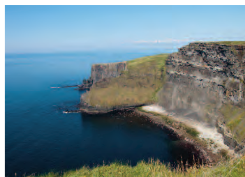
Cliffs of Moher, Ireland's west coast