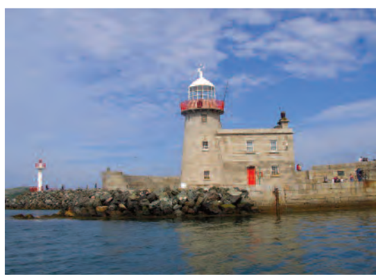
Howth, near Dublin, Lighthouse

Look at the pictures from exercise E and tell the story of Molly Malone in your own words.